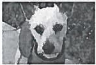
Mastik is a 1-year-old Havanese mix looking for a forever home. 4